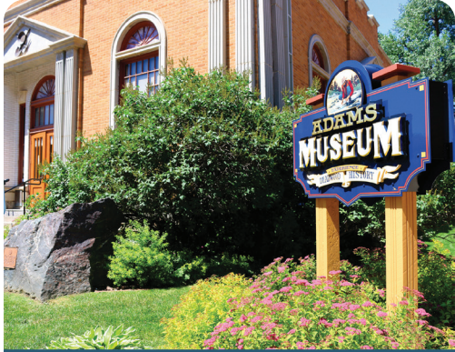
5 ADAMS MUSEUM • Deadwood 605.722.4800 • DeadwoodHistory.com/ About-Us/Properties/Adams-Museum.html