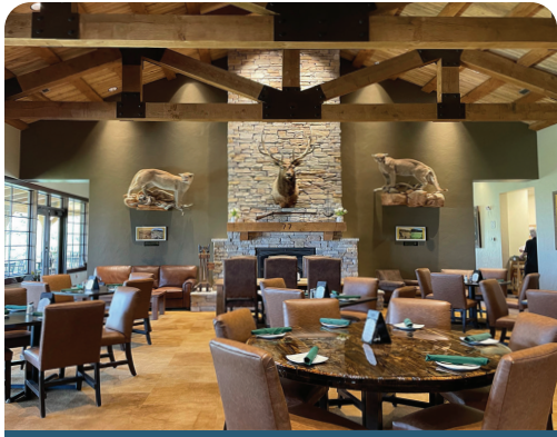
1 77 STEAKHOUSE & SALOON Hulett, WY • 307.467.5773 DevilsTowerGolf.com/Events/Restaurant