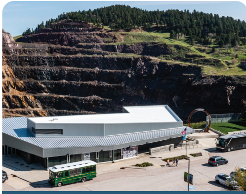
3 SANFORD LAB HOMESTAKE VISITOR CENTER • slhvc@sanfordlab.org Lead, SD • SanfordLab.org/SLHVC