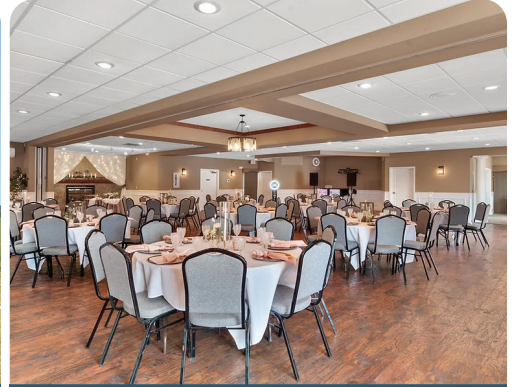
8 ANGELS CATERING & RECEPTIONS Rapid City • 605.721.9229 AngelsReceptions.com