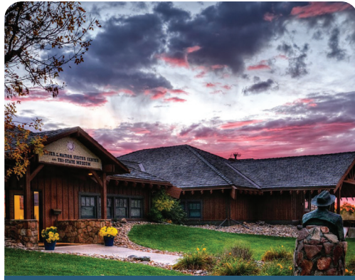
2 TRI-STATE MUSEUM & VISITOR CENTER Belle Fourche • 605.723.1200 TheTriStateMuseum.com