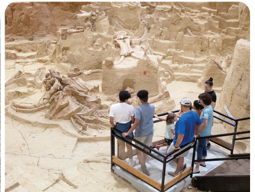
17 THE MAMMOTH SITE Hot Springs • 605.745.6017 MammothSite.org