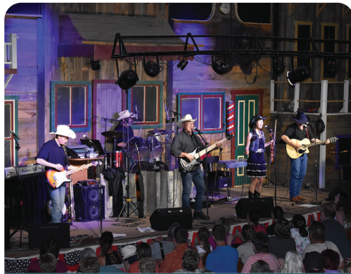
11 FORT HAYS OLD WEST TOWN & DINNER SHOW • Rapid City 605.394.9653 • FortHaysOldWestTown.com