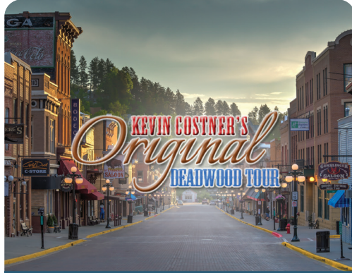
6 KEVIN COSTNER'S ORIGINAL DEADWOOD TOUR • Deadwood 605.578.2091 • DeadwoodTour.com