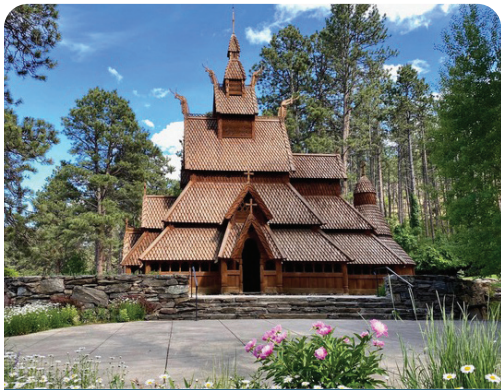
10 CHAPEL IN THE HILLS Rapid City • 605.342.8281 Chapel-In-The-Hills.org