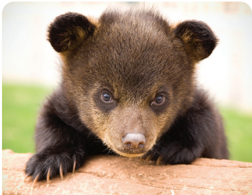
12 BEAR COUNTRY USA Rapid City • 605.343.2290 BearCountryUSA.com