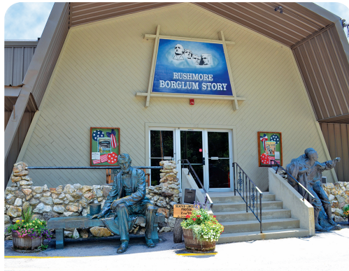
13 RUSHMORE BORGLUM STORY Keystone • 605.666.4448 RushmoreBorglum.com