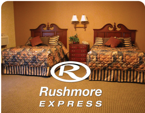
14 RUSHMORE EXPRESS Keystone • 605.666.4483 RushmoreExpress.com