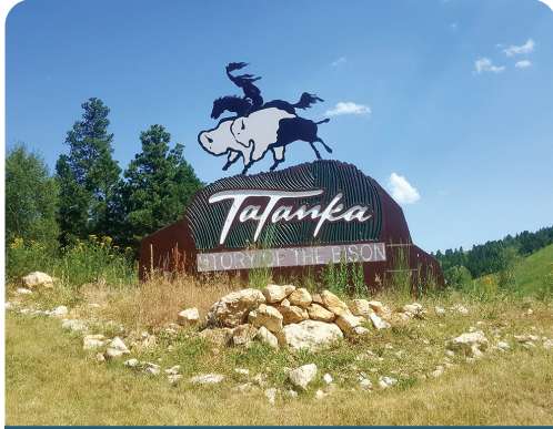
7 KEVIN COSTNER'S TATANKA STORY OF BISON • Deadwood 605.584.5678 • StoryOfTheBison.com