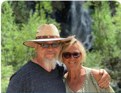
9 BLACK HILLS ADVENTURE TOURS & VACATION PLANNING • Hills Wide 605.666.4448 • BlackHillsAdventureTours.com