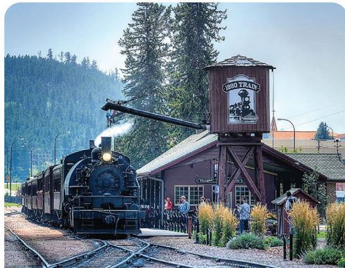
15 HILL CITY CHAMBER OF COMMERCE Hill City • 605.574.2368 VisitHillCitySD.com