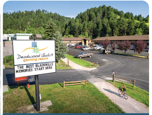
4 DEADWOOD GULCH GAMING RESORT, TRADEMARK COLLECTION BY WYNDHAM 605.578.1294 • DeadwoodGulchResort.com