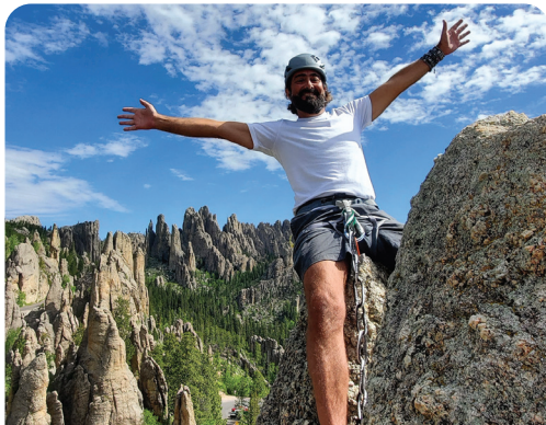
16 SYLVAN ROCKS CLIMBING SCHOOL & GUIDE SERVICE • Custer 605.484.7585 • SylvanRocks.com